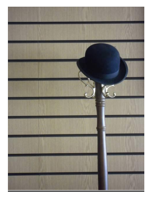
Cecí n'est pas une Magritte.

The railway bridges in Eccles have now been replaced. Throughout July work continued on the substantial new road decks. At the Chadwick footbridge work continued on the approach slopes. Pavement and road surfaces are being put in and the bridges should be open for use in early August. The Albert Road Bridge will have an official reopening ceremony at 09.00 on Monday 1 <sup>st</sup> August! If space allows we shall run a pictorial about the work in next month's ESN.