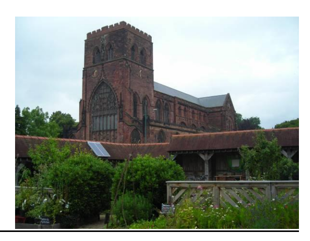
In the castle grounds.