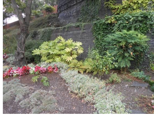
Four views of the station garden as we move into autumn. The first two show the thread of the grey 'wave' design – symbolic of travel. The third shows a composition climbing to the walls above. The last picture is of the late flowering sedum spectabile fronting the 'alpine' section.